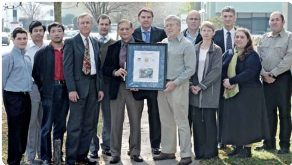
Some of the Chairman's Award recipients' pictured with the Chairman and CEOs from Plantic Technologies and the CRC-P